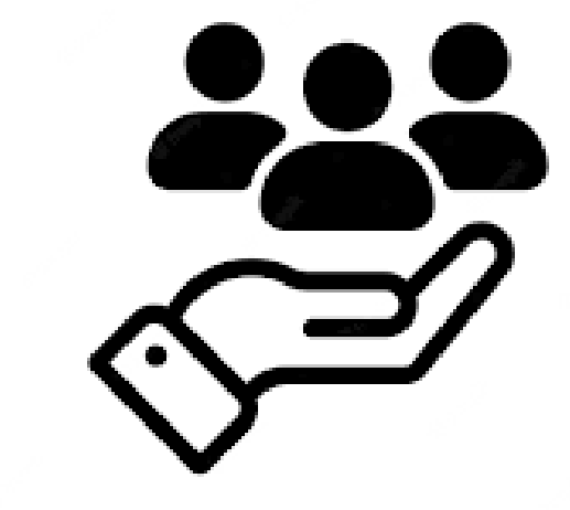
Land of Good People